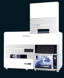
NEW! MILLING UNIT M6