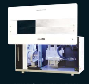
MILLING UNIT M5 HEAVY