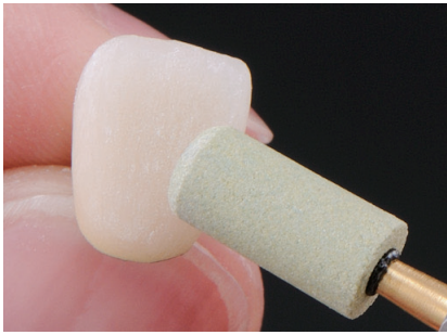
CY5: Surface adjustment Excellent cutting performance offers convenient surface adjustment with efficient material reduction.

EFFICIENT, VERSATILE, GENTLE ON THE MATERIAL