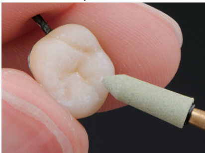
TC4: Detailed finishing Whether dressed or in its original shape, TC4 helps to efficiently create surface details and make occlusal adjustments.