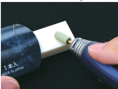
For cleaning and shape adjustment, press Dura-Green DIA against the Shofu Adjuster (aluminium oxide) using a grinding motion.