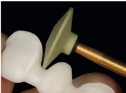
KN7: Framework adjustment Gentle on the material when making interdental or marginal corrections and wall thickness adjustments.