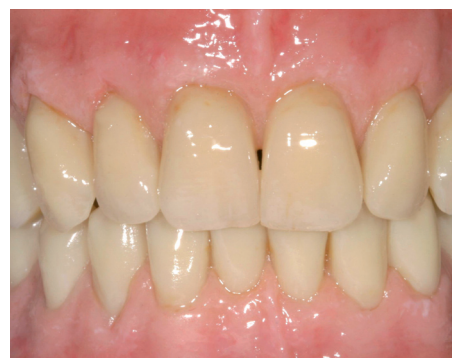
Upper teeth 13-23 and the gingiva are individualized with LITE ART and Ceramage.