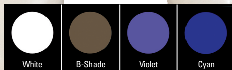
Under natural light conditions

LITE ART paste stains have a fluorescence quite similar to natural teeth. Their natural effect persists even under artificial light conditions.