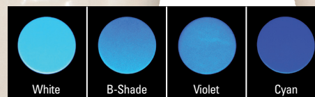
Even dark colors show vital and natural reflections under ultraviolet light