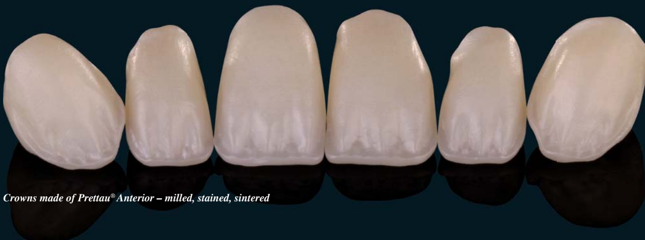
Crowns made of Prettau® Anterior – milled, stained, sintered