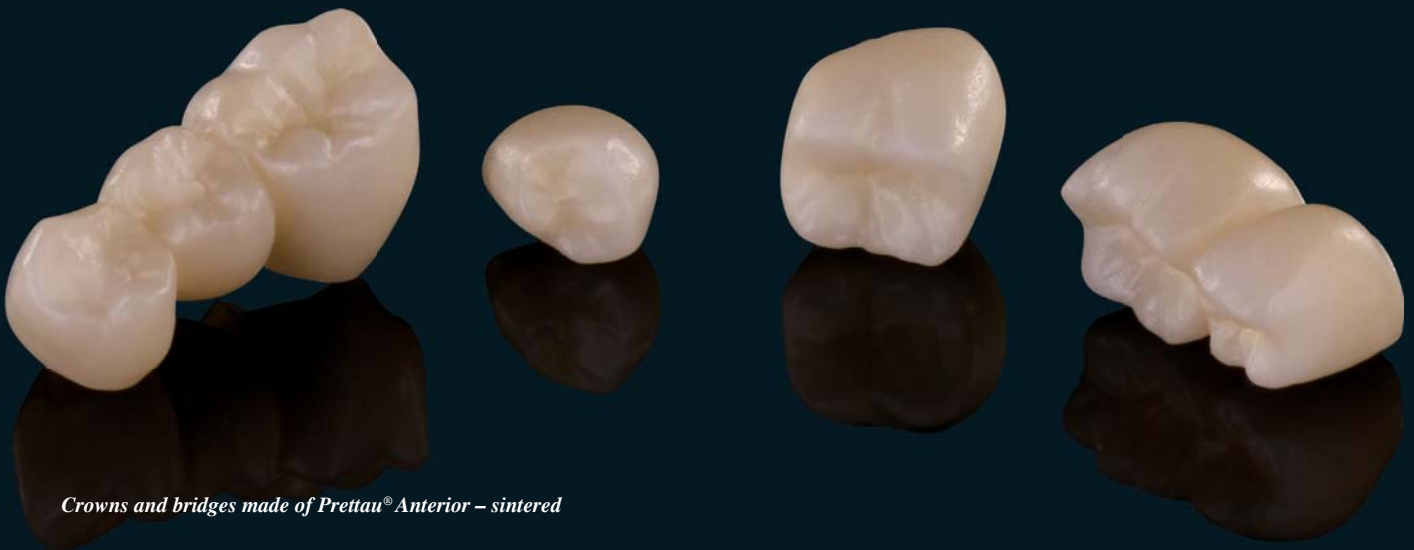
Crowns and bridges made of Prettau® Anterior – sintered